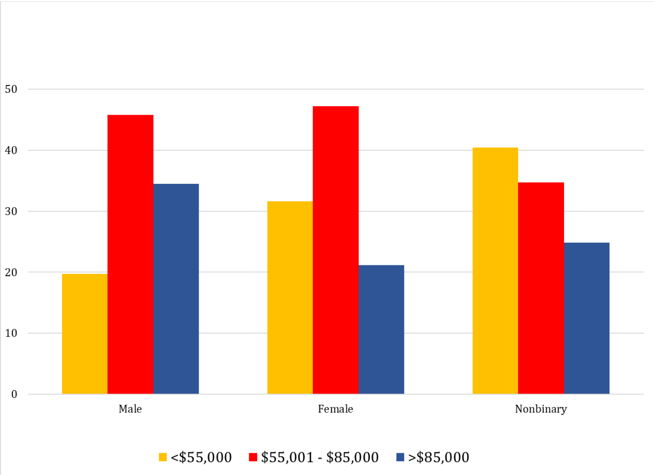
Figure 2: Annual Pre-Tax Earnings by Gender Identity, Percent Distribution of RN 2020 - Primary Work